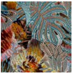
5014-01 Coral Bells