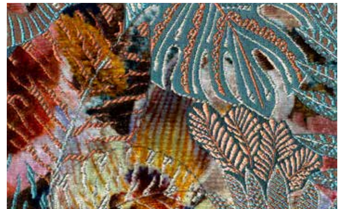
(Detail Showing Flatwoven Structure and Printed Pile)

Moreover, Daintree is a jacquard patterned velvet, featuring specific areas with velvet pile and other areas with a flat woven ground. This flat woven ground is woven intricately with three weft yarns (colors) which form the distinguishable leaf pattern and color of the fabric. For applications requiring pattern matching, the flatwoven structure should be used for the alignment.