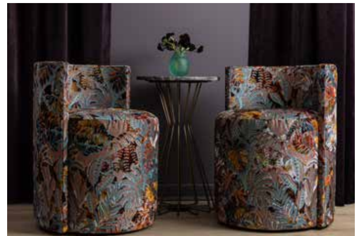
(One chair upholstered with the lower layer, the other with the top layer of the velvet, showing mirrored pattern)

Due to Daintree's face-to-face weaving method and the jacquard pattern, the design on each of the two resulting velvet pieces is a mirror image of the other. For instance, a leaf motif appearing on the left side of the velvet for the lower layer will be mirrored and appear on the right side of the velvet for the upper layer.