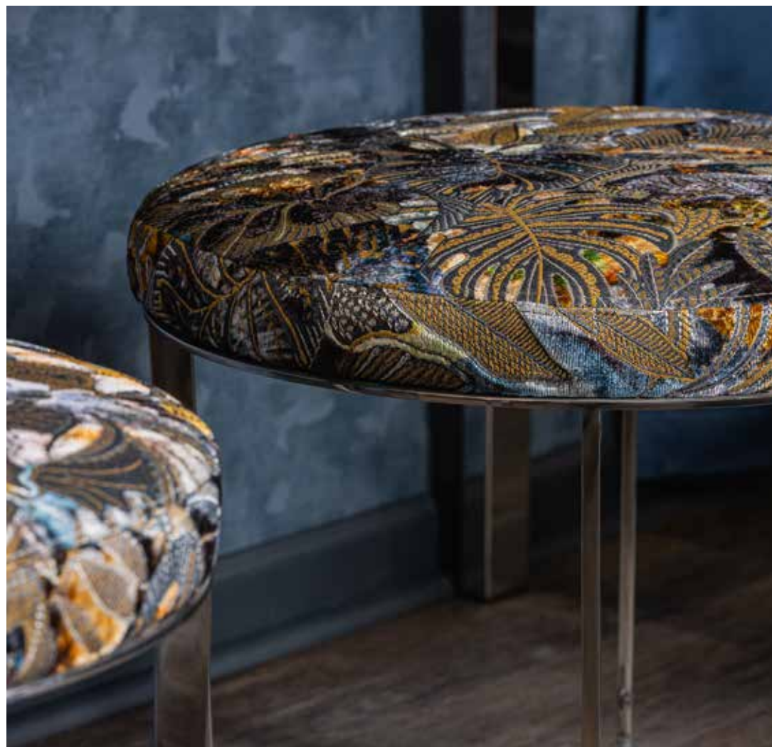
5014-02 Daintree - Blue Flax