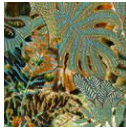
5014-03 Jungle Canopy