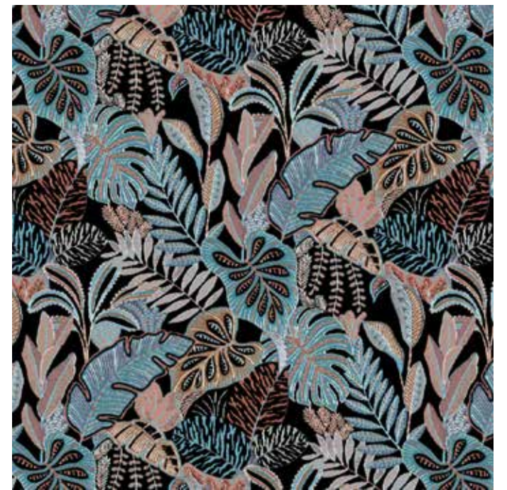
(Color = Flatwoven Ground. Black = Pile Areas For Printing)

This complex and bold woven pattern harmonizes beautifully with the colorful printed pile. Only the pile absorbs the printed design, maintaining a variety of rich colors, rather than a fixed color for each section of the pattern. The woven ground and its colors establish the pattern's repeating structure, while the printed pile introduces a nuanced complexity and a degree of spontaneous color variation. When pattern matching is necessary, the flatwoven structure should be used for alignment.