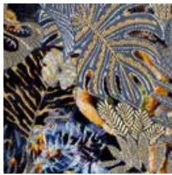
5014-02 Blue Flax