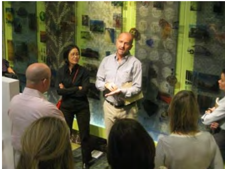
Brentano National Sales Manager speaks with sales representatives about additions to the Brentano Green line of eco-friendly textiles.