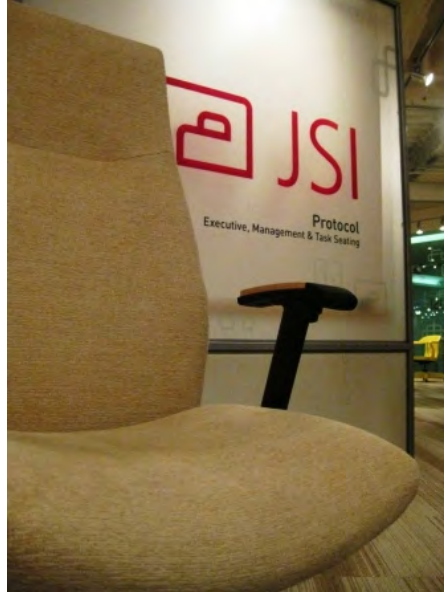
Brentano's stunning upholstery Shade and Shadow was spotted at JSI.

260 Holbrook Drive Wheeling, IL 60090 USA t 847.657.8481 f 847.657.8641