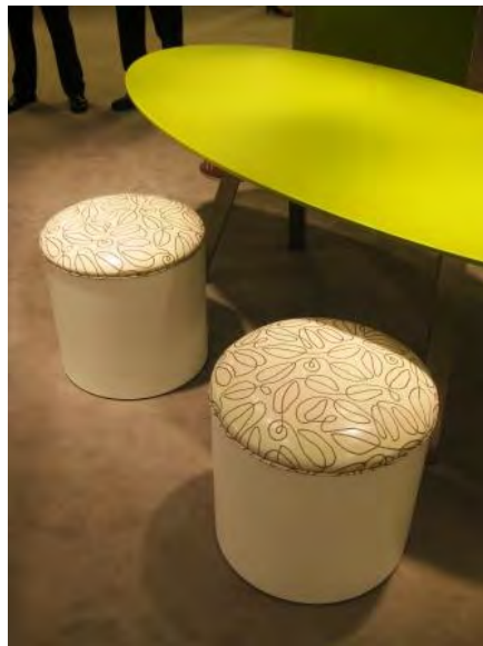
Prismatique selected eco-friendly faux leather De-Vine as an ottoman accent upholstery.