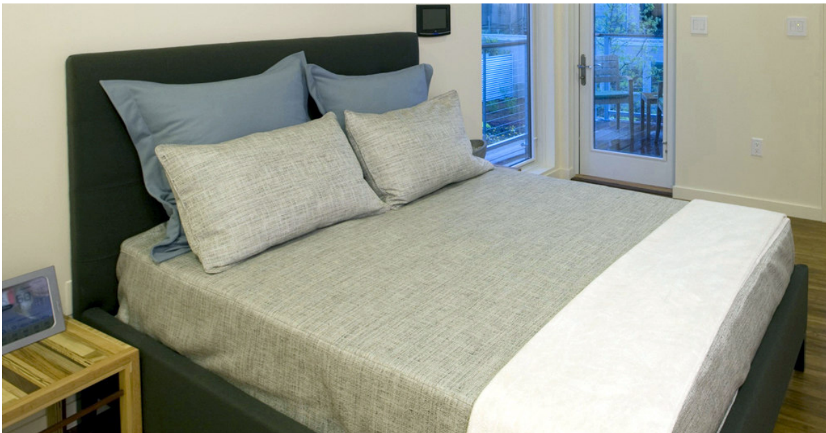
Platform bed upholstered in Brentano Green fabrics, as seen at Chicago's Museum of Science and Industry Smart Home: Green + Wired exhibit.

*More photos of the Elements collection and the Smart Home exhibit included on cd.