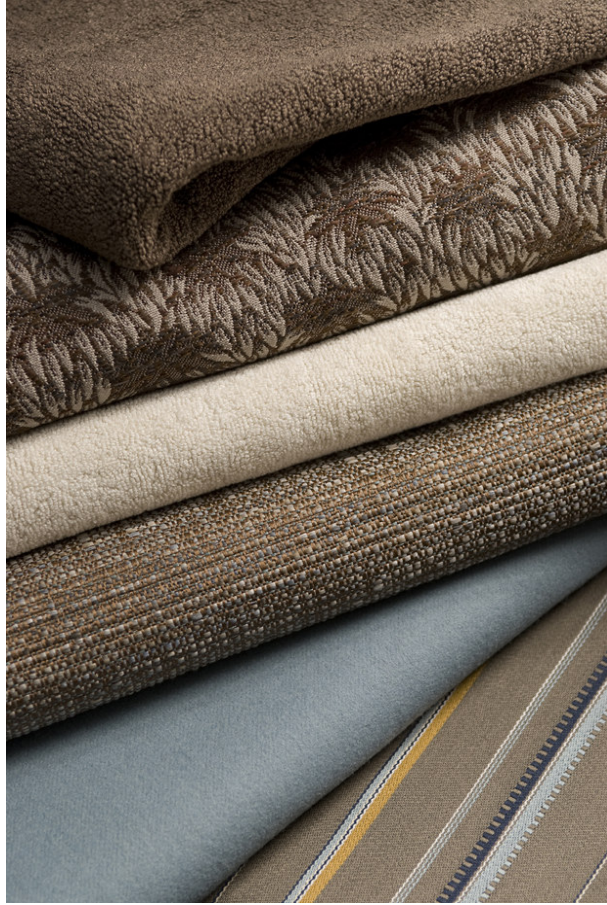
Brentano's eco fabrics, including (top to bottom) Bamboo Cloth in Footbridge, Rainforest in Cameroon, Bamboo Cloth in Moon, Barkcloth in Mountain, Eco Flannel in Bluebird and Eco Stripe in Mountaintop.